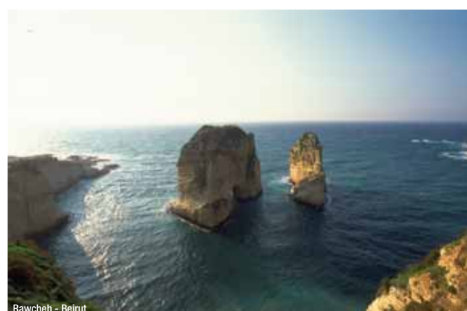
Rawchieh - Beirut